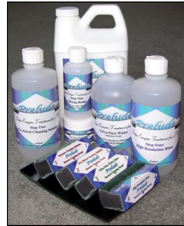
Prelude Quartet, a four-step cleaning process, shown above includes four brushes. Replacement pads sold separately.

Wet the bottom of Brush 2 with the Prelude Step Two Pre-Mixed Cleaning Solution. Wet the record thoroughly. Apply Brush 2 to the record using light to medium pressure. Wait 10 seconds. Do not let the record dry out during this time. Lightly apply Brush 2 again for 3 to 6 seconds and then vacuum off the record.